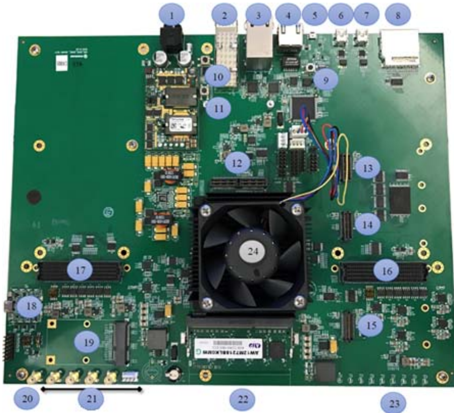
Figure 2. Location of Key Connectors on IDT SMU Board