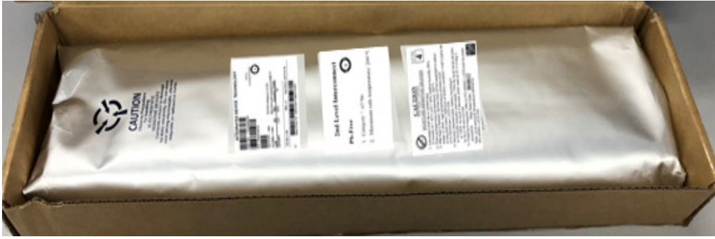
Existing Label Pasting